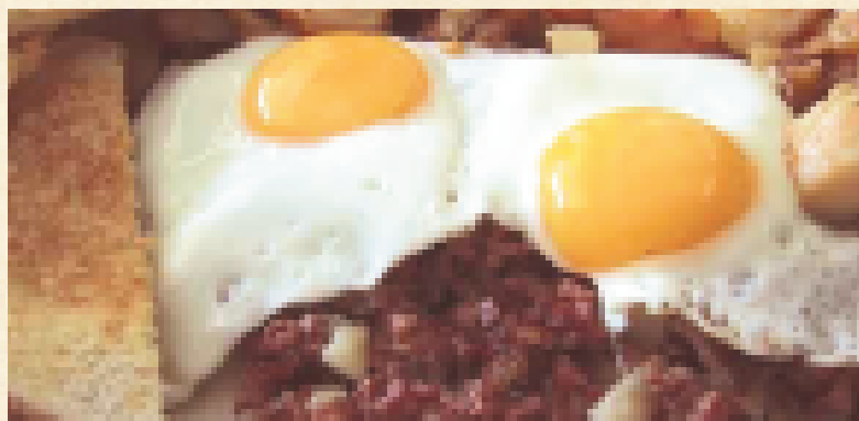
Corned Beef Hash and Two Eggs Any Style with home fries and toast $7.95

French toast with grilled ham, white turkey meat and melted Swiss cheese $8.50