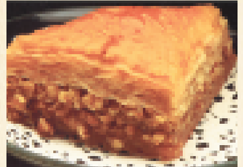
Greek Baklava $4.50