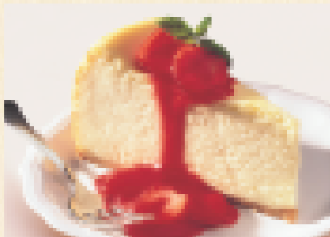
Strawberry Cheesecake $5.50

Greek Baklava Sundae $7.95 Assorted Puddings $3.75 Jell-O $2.95