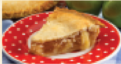
Assorted Pies $3.95 Pie ala mode $5.95

Ice Cream Chocolate, Vanilla, Strawberry, Sherbet 2 scoops $2.95 • 3 scoops $3.95