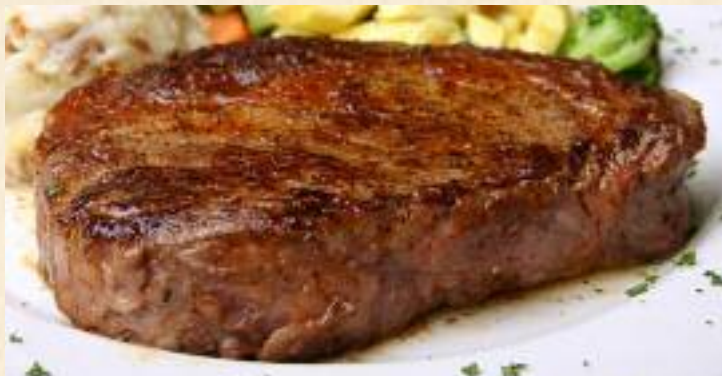
NY Sirloin Steak (16 oz.) Topped with onion rings $23.95

with French fries, onion rings & coleslaw $13.95