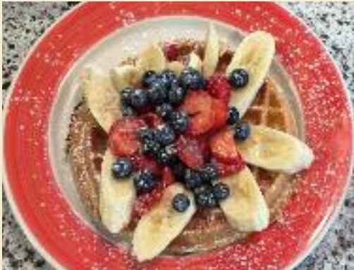
Red, White and Blue Waffle Fresh strawberries, blueberries & bananas $9.10