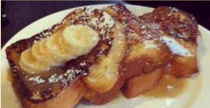
GOING BANANAS BREAKFAST SPECIALTY French Toast or Pancakes Topped with our own foster sauce (caramelized bananas, pecans, brown sugar and banana liqueur) $9.25