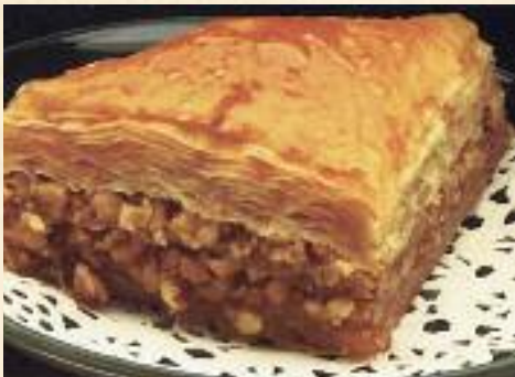
Greek Baklava $4.75