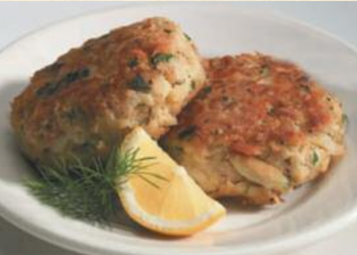
House Made Maryland Crab Cakes Two house made crab cakes broiled with horseradish sauce, on a bed of sautéed baby spinach & Portobello mushroom $22.49

Florida Grouper Filet with Roasted pineapple habanero sauce 18.95