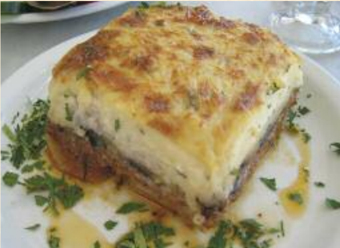
Baked Moussaka Served with Greek salad $15.49