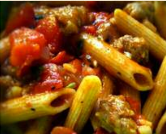
Penne Sinatra Penne Pasta with mushrooms, Italian sausage in a pink vodka sauce $15.49

Gyro Platter (Beef or Chicken Strips) with Greek Salad, French Fries & Pita Wedges $14.75