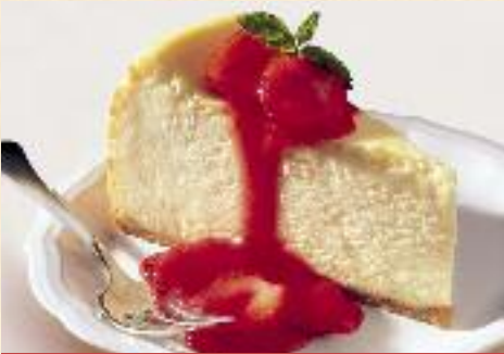
Strawberry Cheesecake $5.79