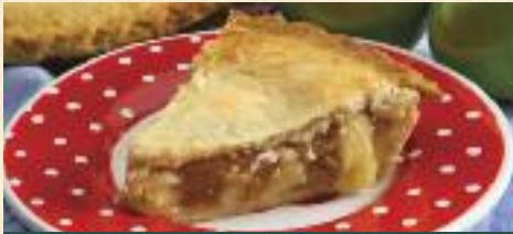
Sugar Free Apple Pie $4.49