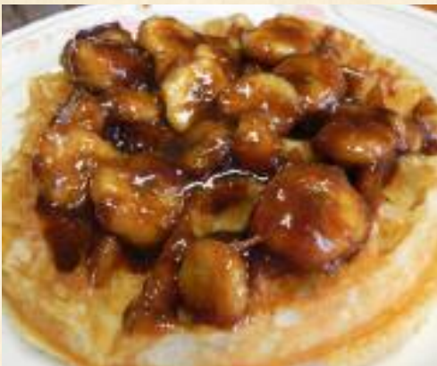
Bananas Foster Waffle Caramelized bananas, pecans, brown sugar and banana liqueur sauce $9.75