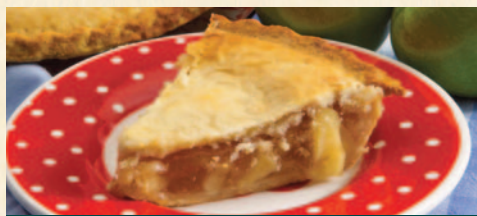
Sugar Free Apple Pie $5.75

Assorted Pies $5.75 Pie ala mode $7.75 Chocolate Cream Pie $5.95 Fudge Brownies $4.75 Cookies $3.35