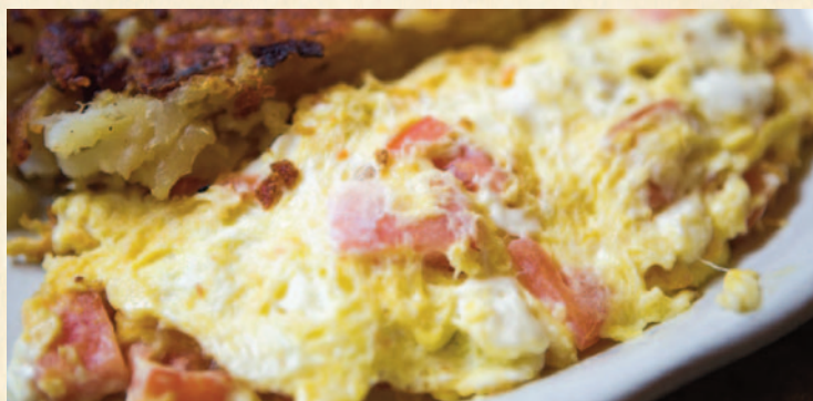
Greek Omelet Feta cheese, spinach and tomatoes $12.95

Fresh sautéed mushrooms and Swiss Cheese $12.95