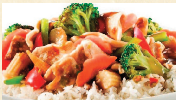
Chicken Teriyaki with stir-fried vegetables over yellow rice pilaf $22.95

Two center cut char-broiled pork chops marinated in olive oil, lemon juice, garlic & oregano, served with potato & vegetable $22.95