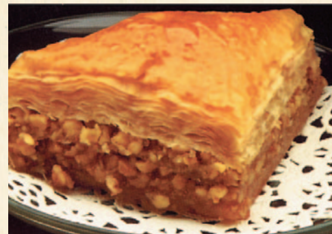
Greek Baklava $7.50

Rice, Chocolate, Tapioca, Bread $4.95 Jell-O $3.95