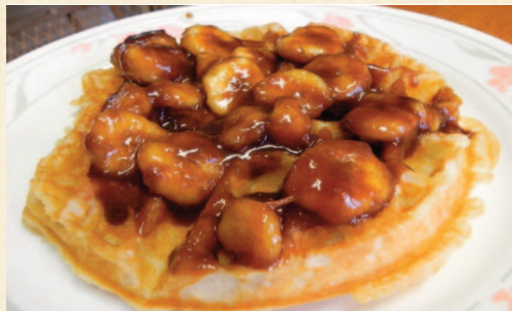
Bananas Foster Waffle Caramelized bananas, pecans, brown sugar and banana liqueur sauce $12.95