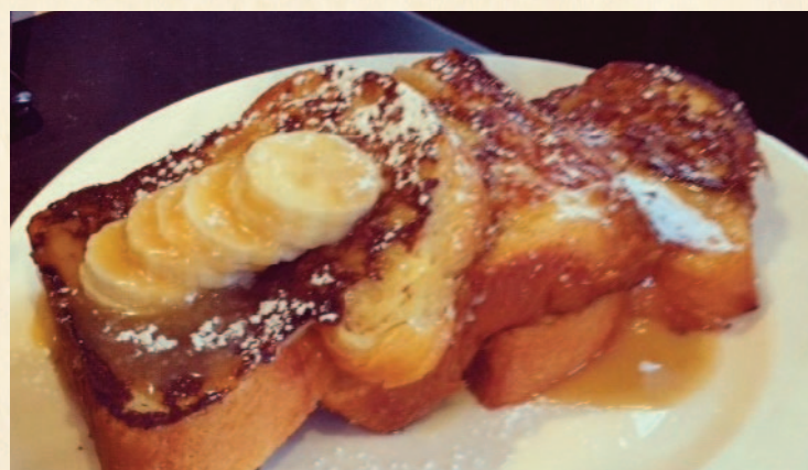
GOING BANANAS BREAKFAST SPECIALTY French Toast or Pancakes Topped with our own foster sauce (caramelized bananas, pecans, brown sugar and banana liqueur) $12.95