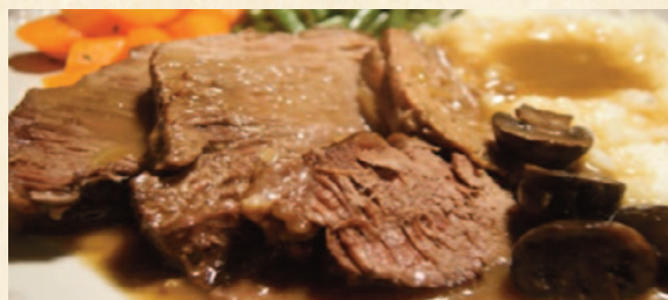
Yankee Pot Roast In its own brown gravy, with potato & vegetable $22.95

Twin chicken breast with vegetables, jalapeno peppers, herbs & cajun spices over rice $22.95