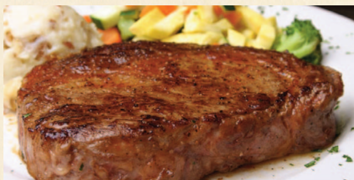
NY Sirloin Steak (16 oz.) Topped with onion rings $31.95

with French fries, onion rings & coleslaw $18.95