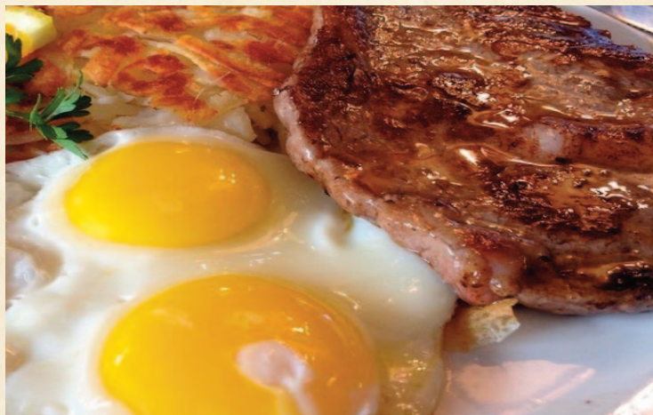
NY Sirloin Steak (10 oz.) and Two Eggs Any Style with home fries and toast $21.95