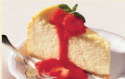
Strawberry Cheesecake $8.50

Plain Cheesecake $7.50 Chocolate Cheesecake $8.50 Triple-Chocolate Cake $7.50 Gourmet Carrot Cake $7.50 Seven Layer Cake $7.50 Lemon Coconut Cake $7.50 Sugar-Free Chocolate Mousse Cake $8.95 Assorted Danish $4.75 Pound Cake $3.95