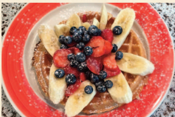
Red, White and Blue Waffle Fresh strawberries, blueberries & bananas $12.95

Belgian Waffle $8.50 Waffle Sundae Your favorite ice cream, wet walnuts, chocolate syrup & whipped cream $12.95