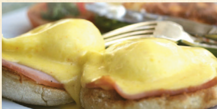
Eggs Benedict Two poached eggs on a toasted English muffin with Canadian bacon and home fries topped with Hollandaise sauce $13.95

2 Fried Eggs $7.95 with Bacon, Sausage, Ham or Taylor Ham $12.45 with Canadian Bacon, Turkey Bacon or Turkey Sausage $12.70